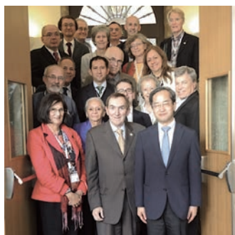
Members of the ICO Bureau 2011–2014 and 2014–2017.

ICO welcomes a new Bureau and RIAO as a new international society member.